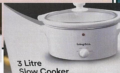
3 Litre Slow Cooker