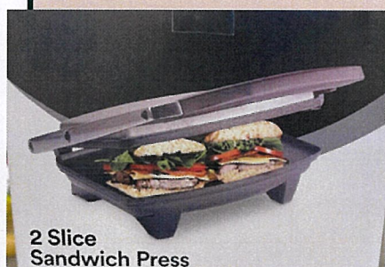
2 Slice Sandwich Press