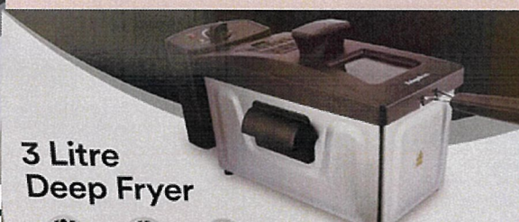
3 Litre Deep Fryer